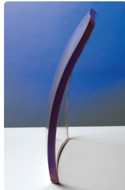
Unique non-uniform shapes can be created with Opticor Advanced Transparency Material.

Stretched acrylic has been the standard for passenger-cabin windows for decades, yet service-life shortcomings have been well known. To meet the industry's needs for enhanced performance, PPG aerospace transparency scientists conducted exploratory research aimed at developing a better material. With chemicals expertise gained as a result of developing aircraft transparency interlayers, they were able to create a new plastic with the characteristics to meet the demanding needs of the aerospace industry today and in the future.