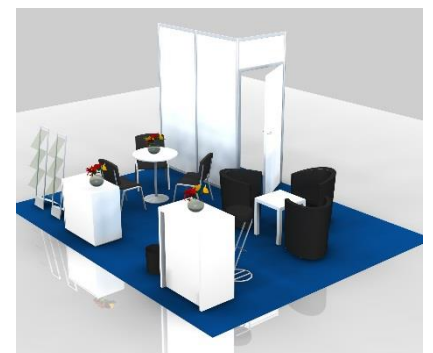
PACKAGE C1 – € 990