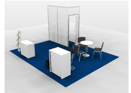
PACKAGE A1 – € 554