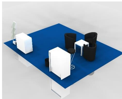
PACKAGE B – € 500