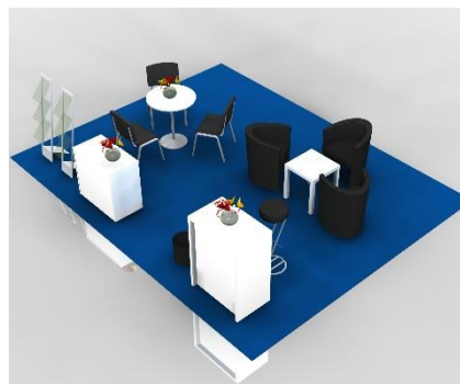
PACKAGE C – € 842