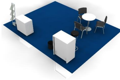
PACKAGE A – € 405